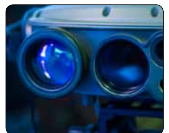
IR glass and crystals